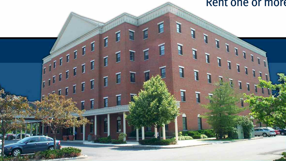
Garden City Prestige with Class-A Office Features

We have the office solution for your immediate office space needs. Rent one or more offices for one month...one year...or longer.