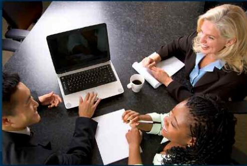
State-of-the-Art Features To Accommodate Your Business Needs