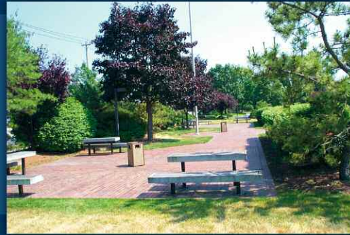
Landscaped Perimeter with Gardens